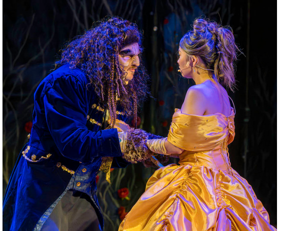
Beauty and the Beast: Join us at 7:30 p.m. Friday, May 3, at Demens Landing for the show.

find out more about the education program, including summer camp classes, click on <u>www.americanstage.org</u> and follow the link for education.